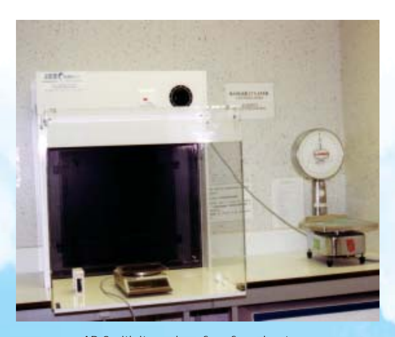
AD 8 with its work surface for solvents use.